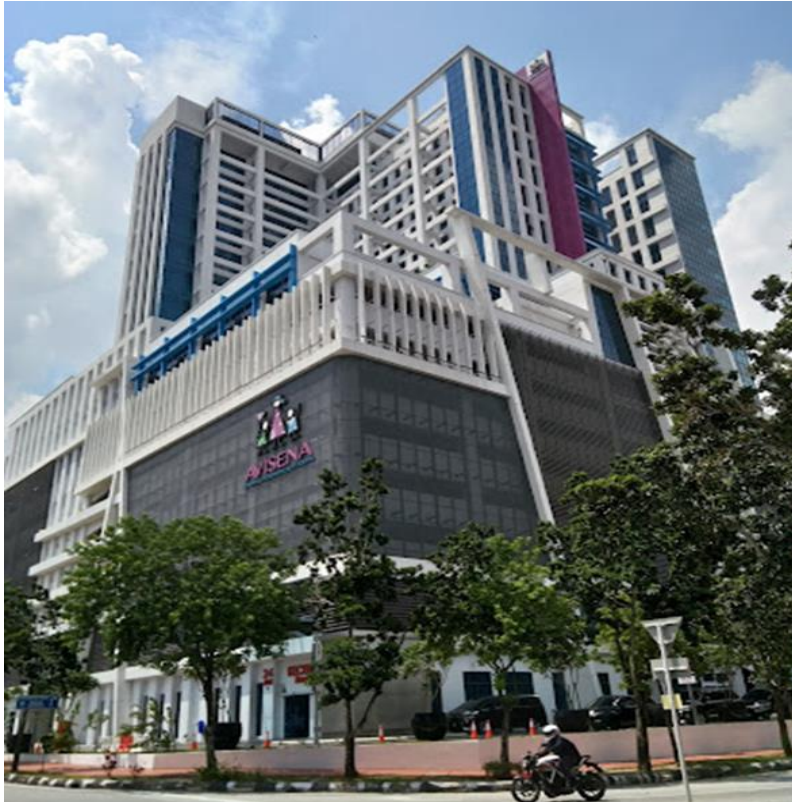
Avisena Specialist Hospital is one of the private hospitals received approval to build a high-rise hospital.